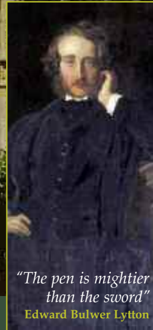
"The pen is mightier than the sword" Edward Bulwer Lytton