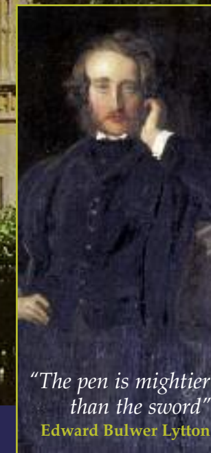
"The pen is mightier than the sword" Edward Bulwer Lytton